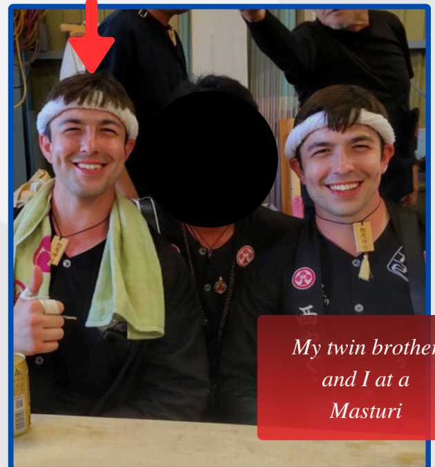
My twin brother and I at a Masturi